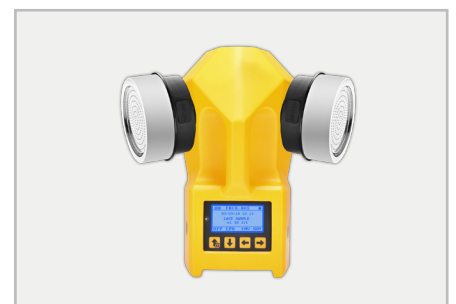
Stable on a work surface in a vertical position