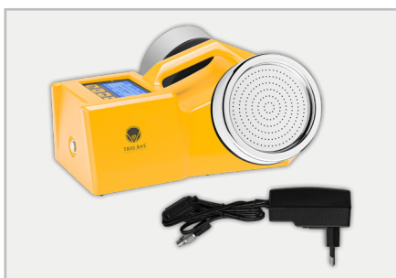
TRIO.BAS DUO with cable

(*) each PACK consists of: 1 air sampler with Bluetooth and battery charger, 1 calibration certificate, 2 s/s ASPI head with s/s cover head, 1 cable for transfer data, 1 robustus carrying case.